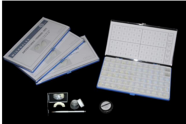
The suitable wax veneers for the ANTERIORES-MODELL-SET®

INDICATION: diagnostic wax-ups, streamlined modelling for long-term temporary appliances, drilling templates, efficient layering of synthetic material, composites, ceramics, pressed all-ceramic and pressed-over-metal/ pressed-over-zirconia, form teachings for training and much more.